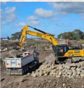
MASON QUARTER ESTATE

Utilising our wide range of Excavators, we have proudly delivered comprehensive civil works across various projects. Our expertise extends to Kerb and channel developments, trenching activities, stormwater drainage, and pit constructions. Not to mention, we excel in foundational and slab works, footpath creation, and road boxing and profiling. Our efficient and reliable services ensure your construction needs are met with precision and professionalism